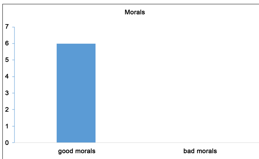
Figure 2. Morals.

When interrogated on their acquisition of social skills in their homeschooling, most students admitted that it had significantly contributed to the development of virtues in their lives. The isolation from their fellow peers presented them with the chance to reflect on the relevance of good morals. Their parents offered social interaction with their peers through virtual communication using social networks. Besides, this category of students also believed that homeschooling presented them with the ability to develop a more robust understanding of the complexities of social interactions. Therefore, they had a better placement to make informed choices on how to relate with others, hence their preference for homeschooling as an alternative to using a conventional public or private schools.